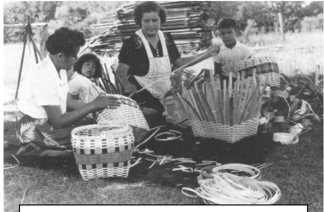
Basket-weaving is deeply imbedded in Ho-chunk tradition. Baskets of this type were produced at Bethany Mission.